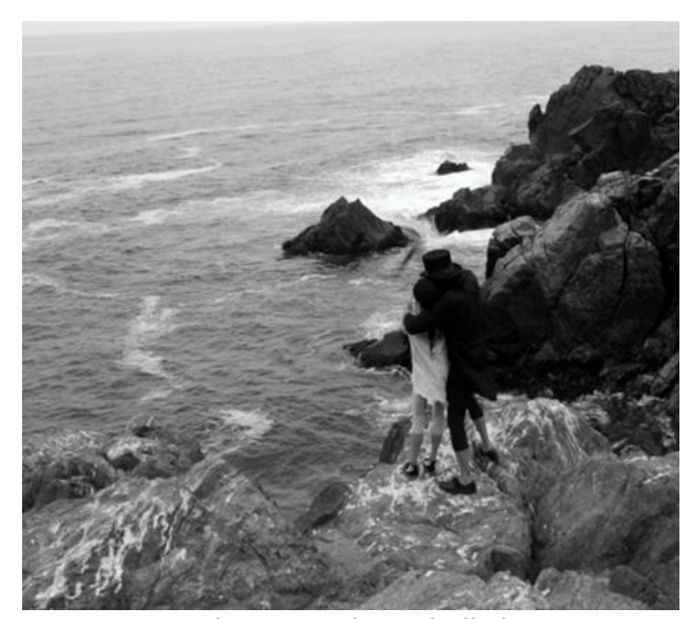
Fig. 2 The Man Who Did All Things Forbidden, 2014, film still.

transgression of having left society behind.