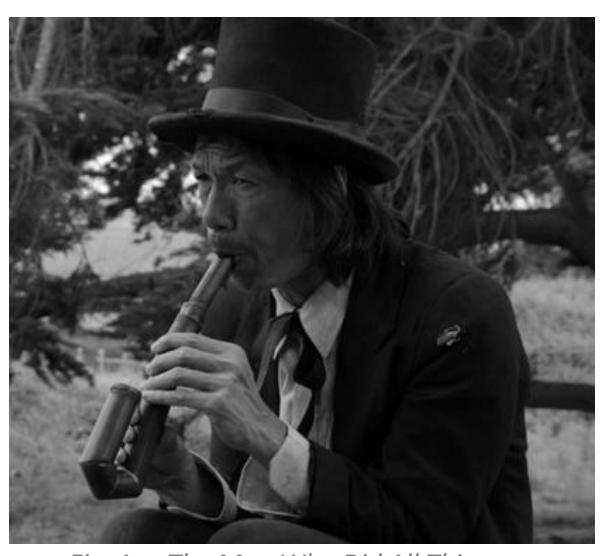
Fig. 1 The Man Who Did All Things Forbidden, 2014, film still.

endeavour into a strange, fragmented journey across a desolate landscape, seemingly in search for a place in which to settle down. The film is not experimental in its visual qualities. Therefore, a clear narrative can be traced; one in which the ending mirrors the initial ritual murder. While the costumes of the actors suggest that the film is set in the early 20th Century, there is no clear sense of time/space, which is appropriate to the film's reproduction of mythical background.